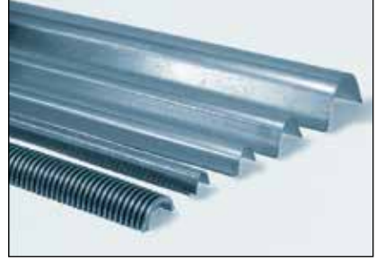
TFK Channels for ChannelTrace Systems,